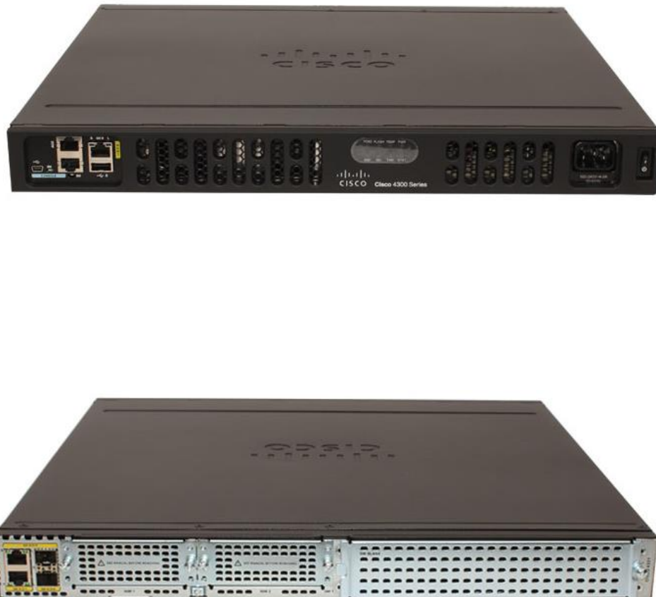
Figure 1. Cisco 4000 Series Integrated Services Routers